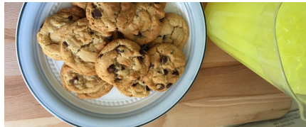
Cookies and Lemonade during registration