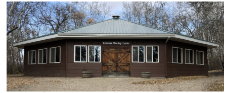
Closing Program at Koinonia