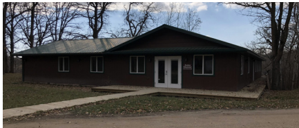
Check in at Anna Manor

A closing program will be presented at the times listed below. The closing program will be held in the Koinonia Worship Center. After the program, campers will be ready to depart camp. Please make sure your child has all of their belongings.