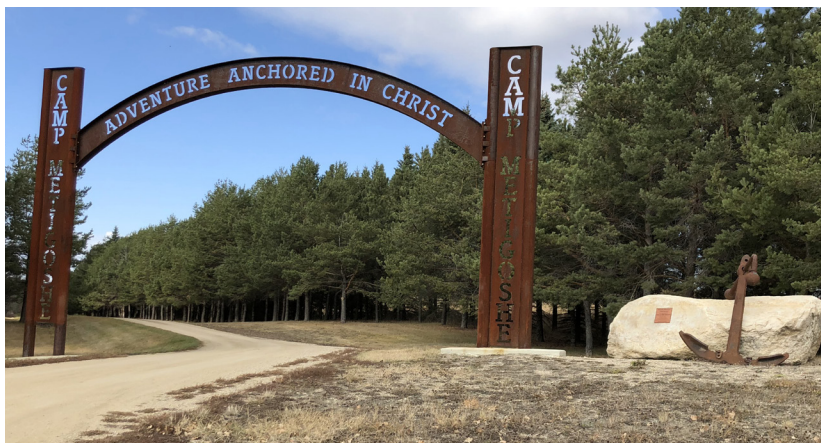
Look for the Front Gate when coming to Camp Metigoshe