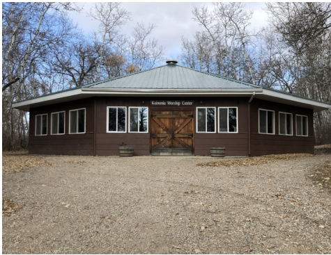
Koinonia Worship Center