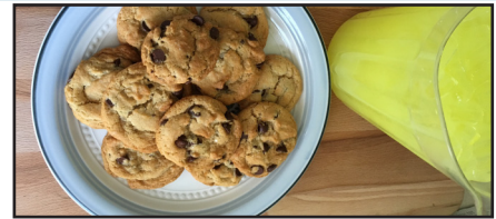
Cookies and Lemonade during registration