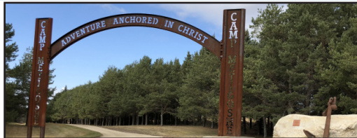
Check in begins at Front Gate

Parents are invited to join their campers at 1:30 on Fridays and 6:00 pm on other nights of the week for a closing program that will last about a half hour. Camp will come to a close after the closing program which starts at the designated check-out time.