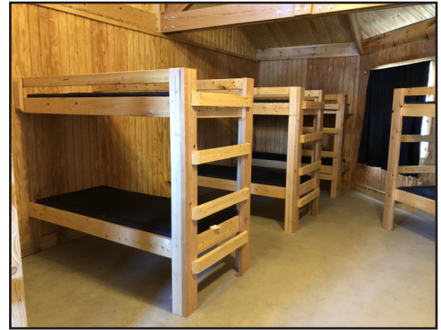
Inside of Cabin