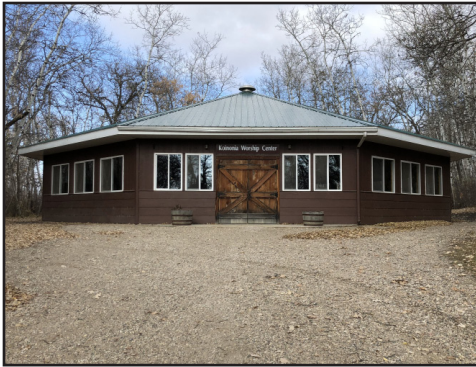
Koinonia Worship Center