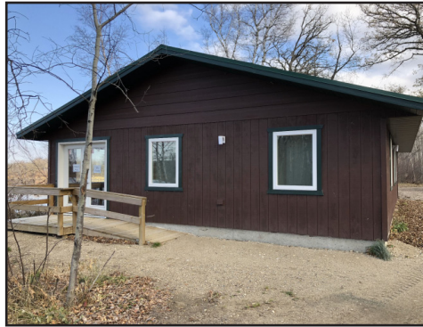
Outside of Cabin