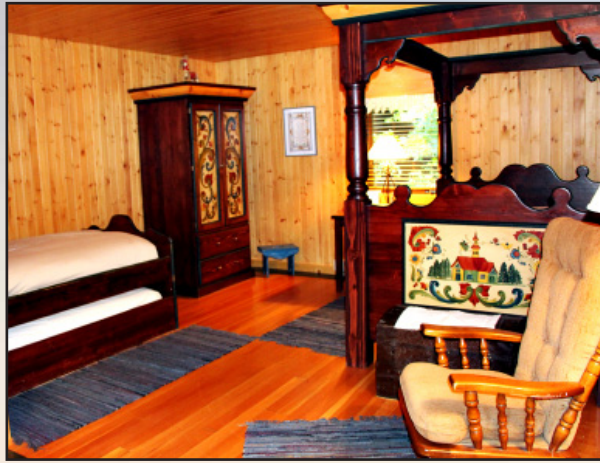
Above: The Scandinavian Room appeals to many. With its golden wood, intricate rosemalling and hidden trundle bed, it is a one-of-a-kind treasure.

Several rooms are available for overnight lodging, including our fourteen uniquely-designed, high-comfort sleeping rooms. Each room is designed with a specific theme from Northern Lights to Pioneer and Victorian to Turtle Mountain. We will nourish you with a wide variety of delicious, home-cooked meals in the dining room covered with rough-hewn timbers supported by fieldstone columns and breathtaking views of the surrounding forest.