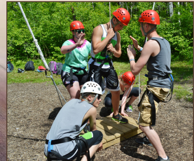
Above: Groups challenge themselves and each other on the high ropes course.

Our high-ropes course, Higher Than The Mountains, is available for a unique and exciting team-building experience.