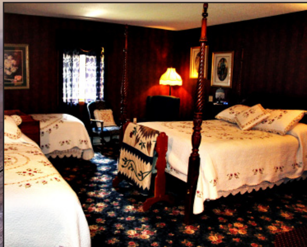
Above: Step back in time when staying in the Victorian Room

Several rooms are available for overnight lodging, including our fourteen uniquely-designed, high-comfort sleeping rooms. Each room is designed with a specific theme from Northern Lights to Pioneer and Victorian to Turtle Mountain. We will nourish you with a wide variety of delicious, home-cooked meals in the dining room covered with rough-hewn timbers supported by fieldstone columns and breathtaking views of the surrounding forest.