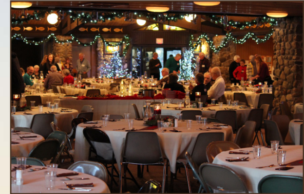
Above: Our dining hall and large meeting area can be combined to accomodate receptions and banquets

Our high-ropes course, Higher Than The Mountains, is available for a unique and exciting team-building experience.