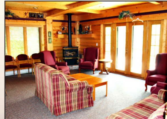
Above: Salama Suite is the perfect setting for a smaller group...cozy, intimate and relaxing.

Planning, teaching, training, dreaming, studying, building relationships--whatever your program must accomplish, our retreat facilities are designed to meet your needs. Meeting spaces, Wireless Internet, TVs, screens, projectors, easels, and other audio visual equipment are available to help accomplish your goals whether you are a group of 12 or 112.