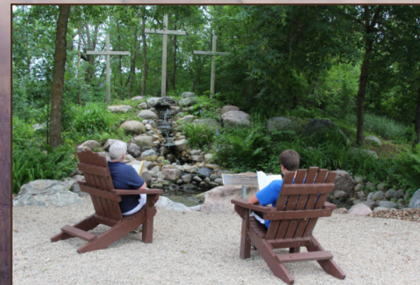
Above: Relax by our waterfall and pond for a peaceful place to read, visit or meditate.