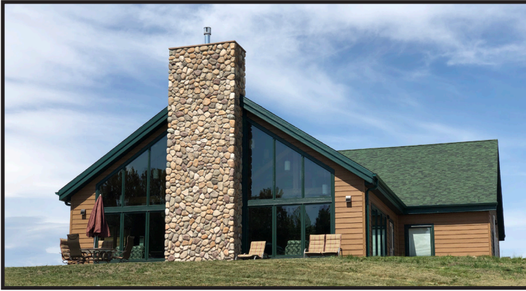
Gary's Place Retreat House

Gary's Place is a year-round retreat house located at the entrance to Camp Metigoshe on Pelican Lake. This beautiful scenic space is perfect for staff gatherings, small family get-togethers, secluded crafting time or any smaller retreat. Gary's Place has 6 lodging rooms with private baths, a full kitchen and expansive outdoor space with a fire pit.