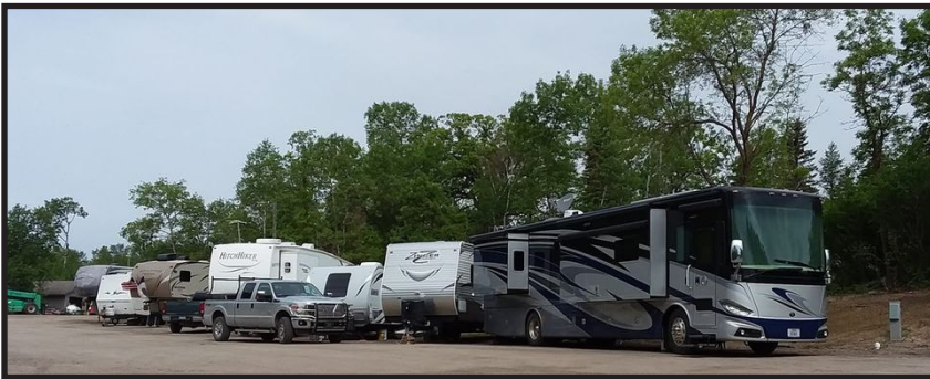
RV and Camper Sites at Christian Center