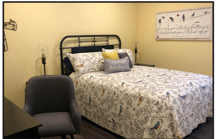
Meadowlark Theme Room