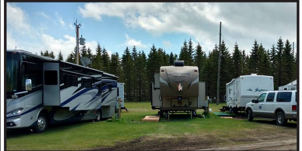
RV and Camper Sites at Pelican Lake