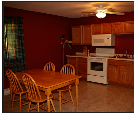
Lee House Kitchen