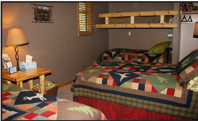
The Wilderness Guest Room