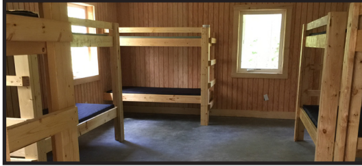
Rustic Cabin Interior