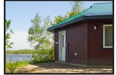
Lake View from Cabin