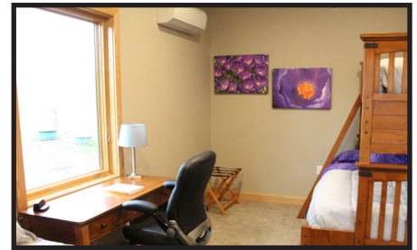
Blooming Crocus Lodging Room