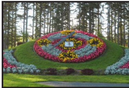
Floral Clock at Peace Gardens