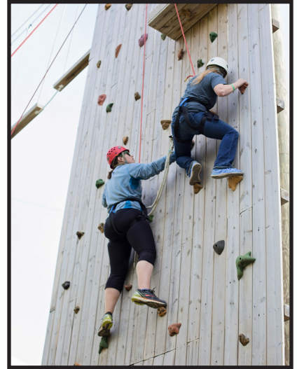
High Ropes Course