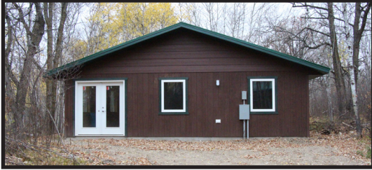
Rustic Cabin Exterior

Pelican Lake is a great place for a more rustic, camp-style get-away. Our Pelican Lake site is available mid-August to mid-September. Whether you want to tent or rent a rustic cabin, there are numerous activities available at Pelican Lake.