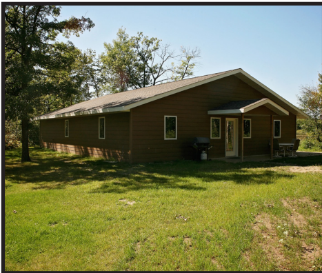
Lee House Exterior

Lee House is a year-round rustic cabin. There are 3 bunk rooms, with 2-3 bunks in each room, a small kitchen, two bathrooms and a gathering area. Enjoy a completely unplugged experience without Wifi or TV.