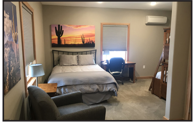
Arizona Desert Lodging Room