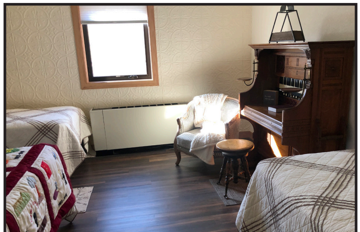
Country Church Theme Room