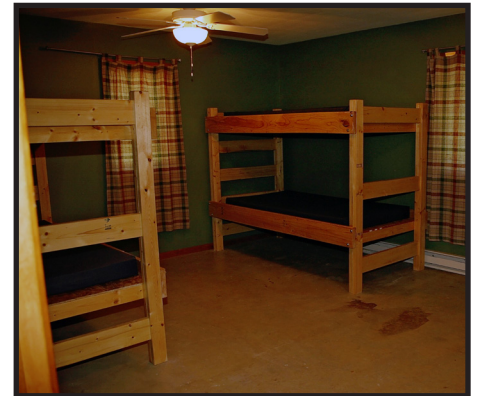
Lee House Bunkroom