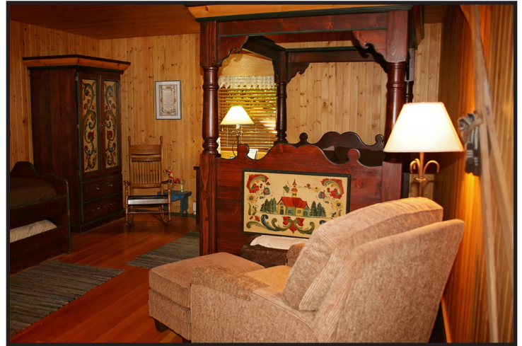
Scandinavian Theme Room